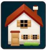
Front of Property Taken : 21/02/2018